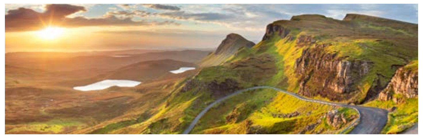
The Scottish Highlands