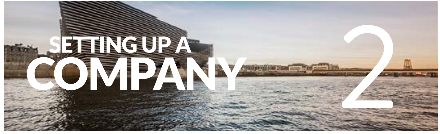
V & A Design Museum, Dundee

Registering your company Choosing how to structure your business Directors/Partners