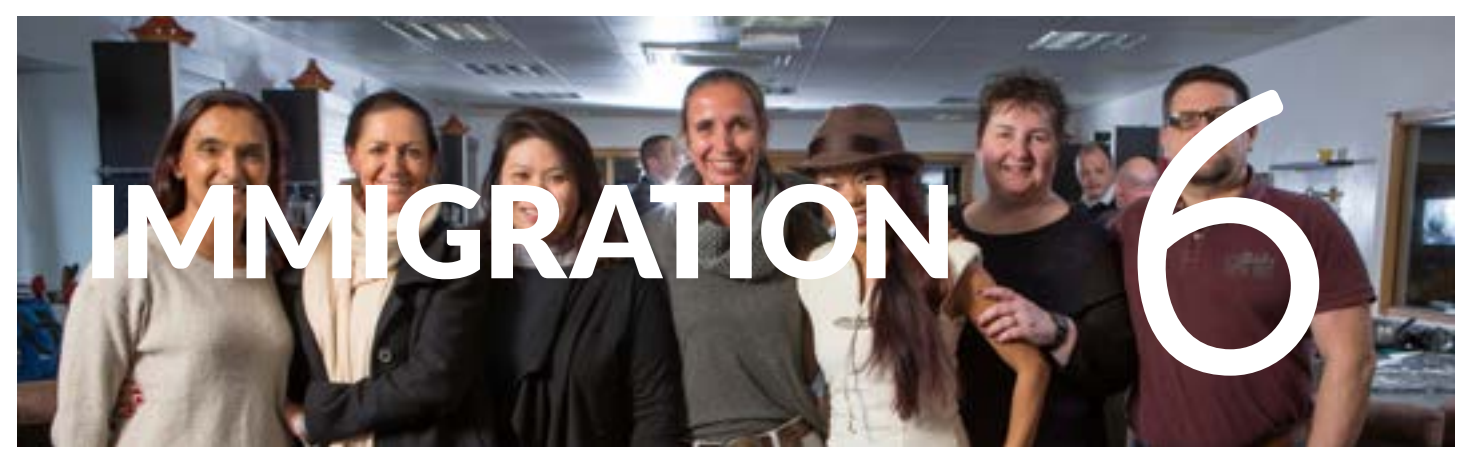
Made in Scotland - Collaborative Export Solutions